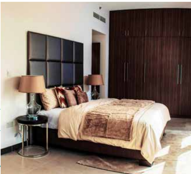
International standards and local sensibilities work together cohesively to create COMFORTABLE living spaces