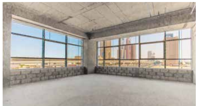
Shell & Core Office