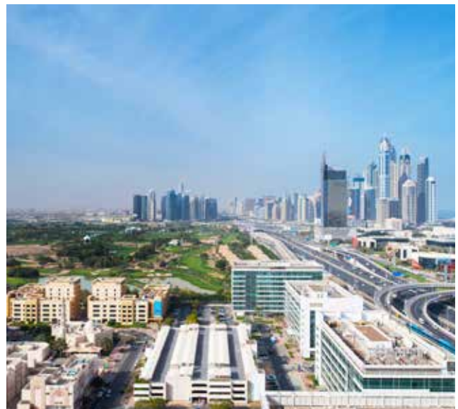
Enjoy the stunning VIEWS of the Golf course, Marina and the iconic Palm Island