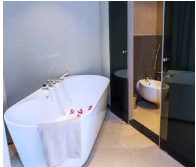
Bathtub & Bathroom