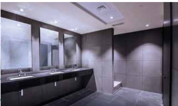
Typical Floor Toilet - Offices