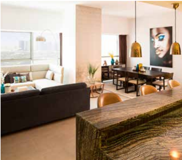
Lounge & Living

A fully furnished mock-up of a residential apartment is ready for viewing. Book your appointment today to see the finished apartment firsthand.