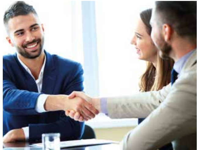
Get HIGH RETURNS for your investment by investing in a partially completed project