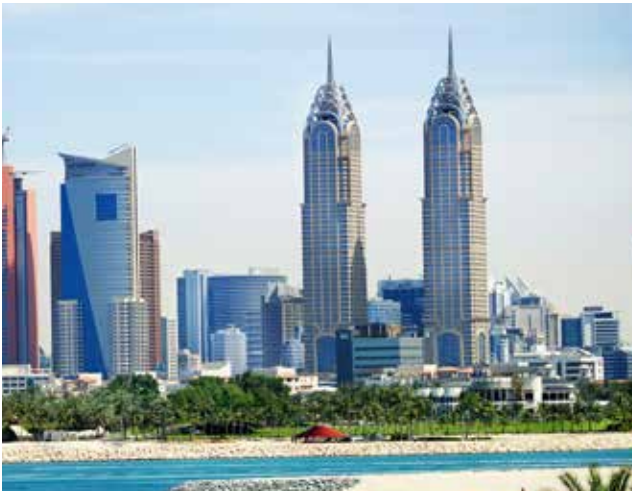
Be in the CENTER of Dubai